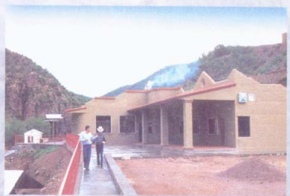
Bunkhouse and Conference Center