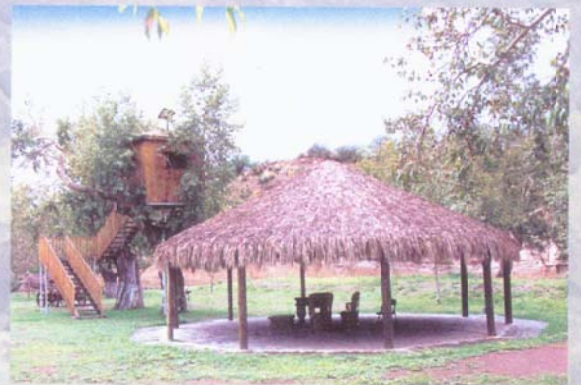
Treehouse and Palapa