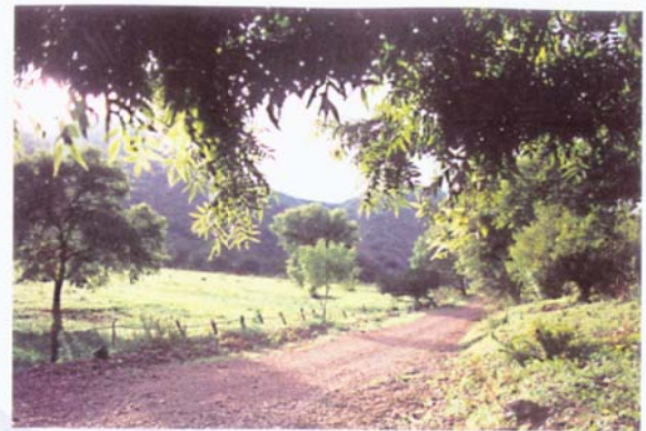
Unlimited Horseback Riding